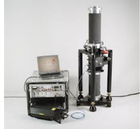
Micro-g LaCoste FG5

S urface gravity gradient \partial g / \partial z \approx 3076 Eotvos